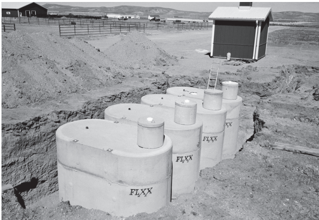
Four mated 3600 gal. cisterns (14,400g total) for agricultural use.

Other mated cistern configurations are available. Contact FRPC sales for details.